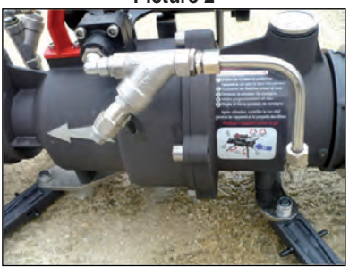
The non closure will create a disfunctioning of the regulation.